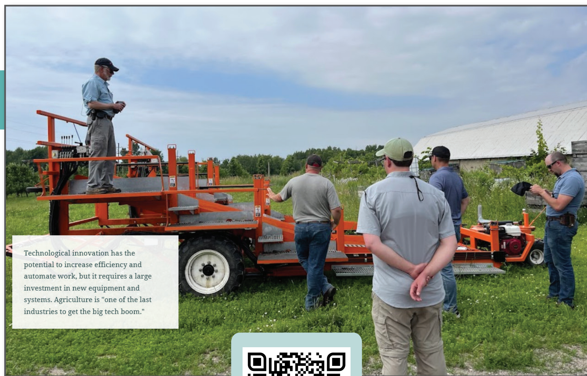
Technological innovation has the potential to increase efficiency and automate work, but it requires a large investment in new equipment and systems. Agriculture is "one of the last industries to get the big tech boom."

The GLLA regional travel experience StoryMap is not yet complete, as the final experience concluded on September 11, 2024. But StoryMaps has already proven to be well suited for capturing the wide range of activities undertaken by the cohort. The text, which describes the daily activities in a chronological order, is interwoven with photos, videos, and journal excerpts for a digital facsimile of a field experience. GLLA staff are pleased with the results so far and are looking forward to having the final product to share with donors, future program participants, and with the current cohort as a digital keepsake documenting their experiences together.